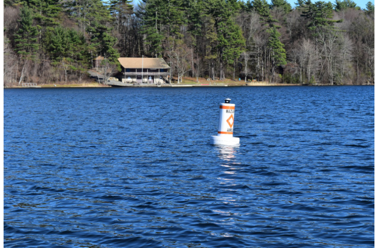
Hazard marker brings attention to Blueberry Island, now a submerged sandbar.

The MPF Board of Directors appropriated funding and selected and installed buoys to further improve boat safety on the lake. Buoys have been installed at the channel and on Blueberry Island. They can be seen both during the day and evening.